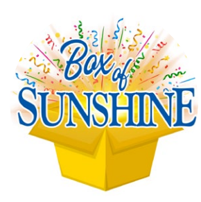
7 Box of Sunshine