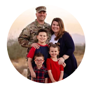
5 Family Impact