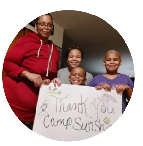
6 What Families are Saying