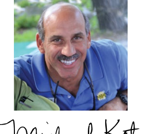
VV (vchart Kal