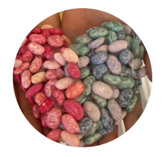
1 Reflecting on 2021

Camp Sunshine's program is offered year-round and has the distinction of having been designed to serve the entire family in a retreat model. The program is free of charge to families and includes on-site medical support. A bereavement session is also offered for families who have experienced the death of a child from a supported illness.