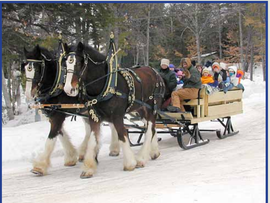
Families enjoying entertainment and fun-filled activities at Camp Sunshine during all seasons.