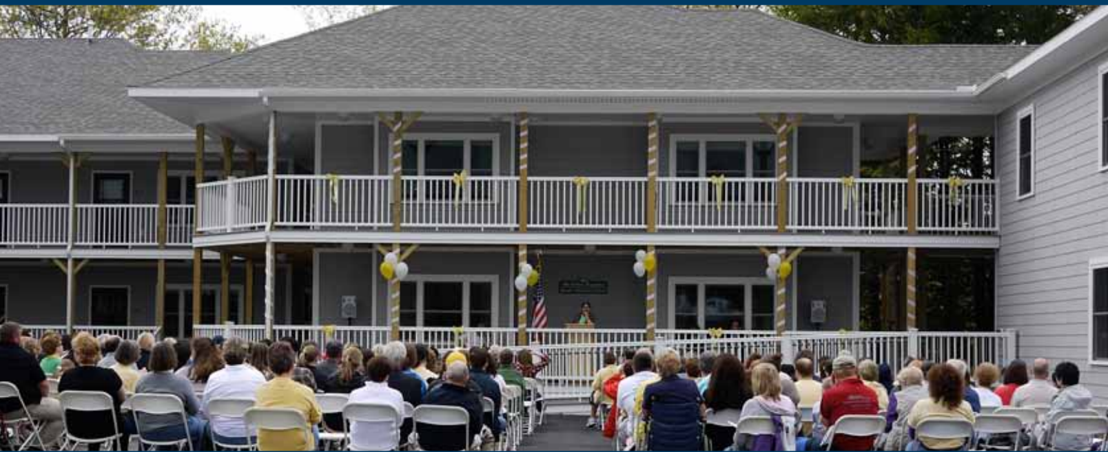
Guests enjoy the dedication of the Orokawa Foundation Family-Volunteer Center .